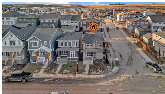
71 Herron St NE, Calgary, AB

Main Floor Exterior Area 914.55 sq ft Interior Area 834.87 sq ft